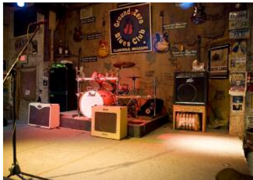
BLUES DOWN HOME: From guitars to show fliers, the Ground Zero stage puts its heritage front and center.

Arkansas Blues and Heritage Festival: Formerly known as the King Biscuit Blues Festival (the saga of how it lost rights to its name is worthy of a blues song), this annual three-day gathering (October 4-6) draws some 10,000 people to the tiny town of Helena, Arkansas (about 30 miles northwest of Clarksdale, most of it a straight shot down I-55), to hear dozens of local and national blues musicians. In the true spirit of music celebrating the down-and-out, it’s also free. (bluesandheritage.com)